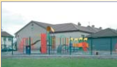
New Cloughleigh Playground

It is now almost three years since the launch of the RAPID II Programme in Ennis. During this period RAPID has yielded a high level of success. There are now a significant number of tangible projects, which have impacted on people's lives to date in the RAPID area.